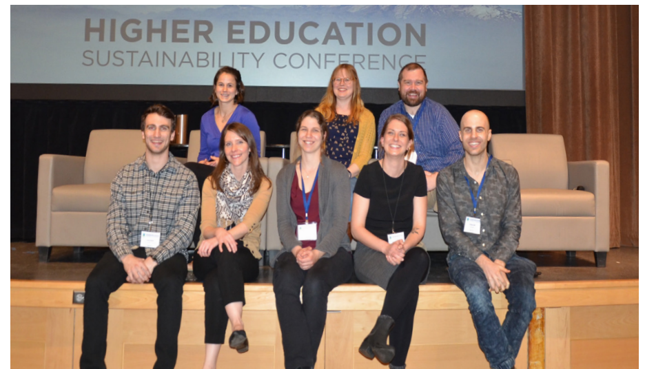
CSO staff at last years WOHESC conference.

PSU hosted the Washington Oregon Higher Education Sustainability Conference (WOHESC). With over 500 hundred attendees, WOHESC is a platform for inspiring change, facilitating action, and promoting collaboration.