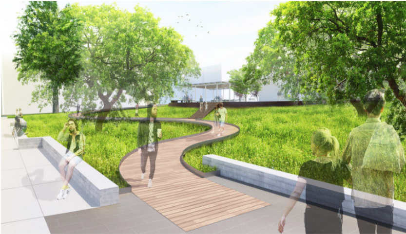
Concept design by 2.ink Studio for the Oak Savanna.

Progress continues on PSU's Open Space Plan with expected adoption this year. Last year, in conjunction with the planning effort, 2.ink Studio led student, staff, and faculty workshops to gather information and create an informed concept design for one of the few remaining open spaces on the PSU campus - the Oak Savanna.