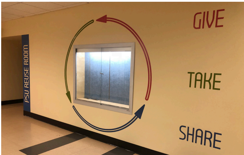
Renopening of the PSU Reuse Room.

Working off past efforts to assess capacity and vulnerabilities, CSO is now leading efforts to engage our community in goal setting and strategy development to finalize our Climate Resiliency Plan.