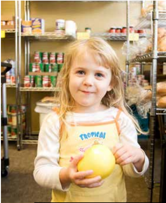
Healthy food makes for healthy kids.

Keeping kids active is important to their health, but so is providing them with healthy food. Thousands of kids don't get proper nutrition, which hinders development and learning. Thanks to Ford Motor Company Fund , the Oregon Food Bank Network is purchasing $100,000 of child-focused emergency food. This includes single-serve milk, juice, applesauce and oats. Fighting childhood hunger in Oregon and Clark County, Washington is a lot easier with Ford Motor Company Fund's generous contribution. 🌱