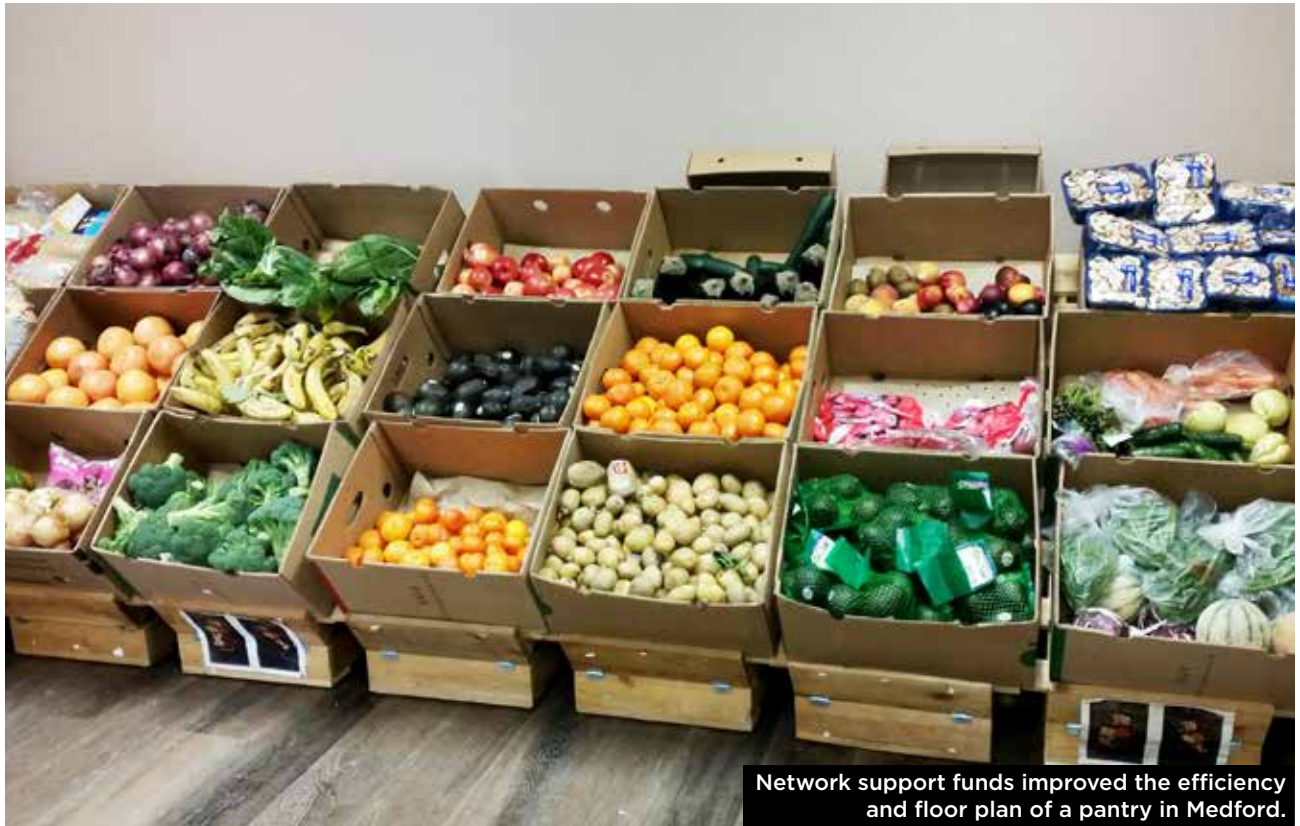
Network support funds improved the efficiency and floor plan of a pantry in Medford.