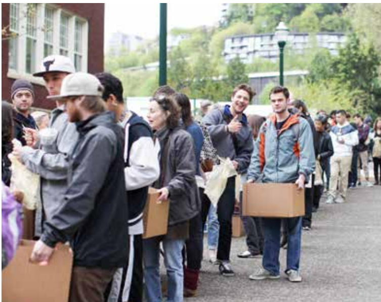
Harvest Share helps food insecure students at Portland State University.

One student used Tumblr to share her excitement of the program saying, "I may be poor, but thanks to the PSU Harvest Share and Oregon Food Bank, I will not go hungry this month!" 🌱