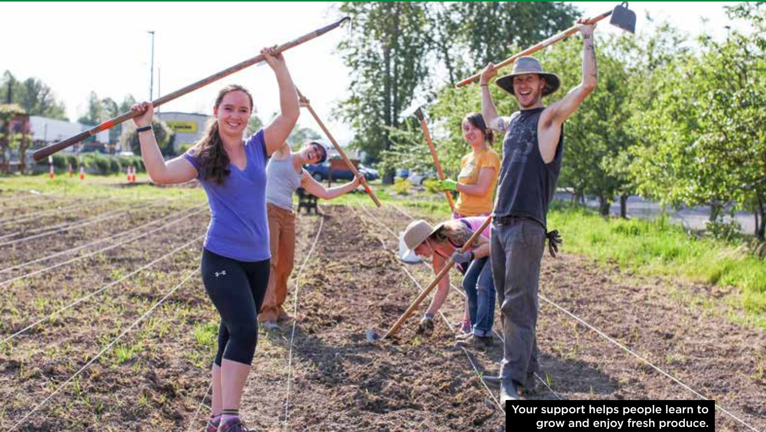
Your support helps people learn to grow and enjoy fresh produce.