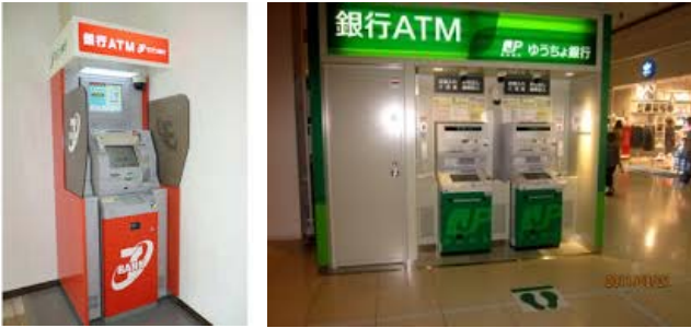
Seven Eleven ATM (Red) and Post Office ATM (Green)

You will find foreign currency station at airport or large bank office. You can use ATM to withdraw cash in Japanese Yen. Seven Eleven ATMs and Post Office ATMs tend to have the lowest charges for international cards.