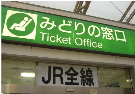
Sign of Midori-no-Madoguchi

Look for green sign to find ticket office. It is usually near ticket gates.