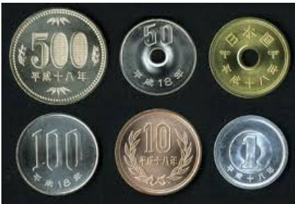
Coins: (Clockwise from top left) 500 yen ($4.5), 50 yen ($0.45), 5 yen ($0.04), 1 yen ($0.01), 10 yen ($0.09), 100 yen ($0.9)