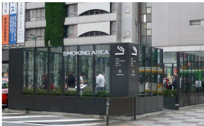
Above: Designated Smoking Area