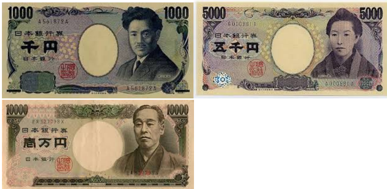
Bills: (Clockwise from top left) 1,000 yen ($9) , 5,000 yen ($45), 10,000 yen ($90)