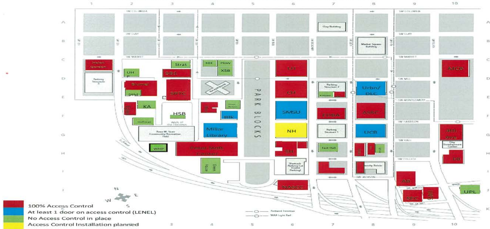
University Access Control Status as of June 24, 2014