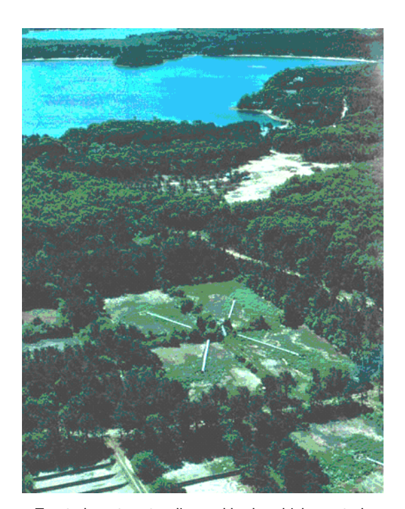
Treated wastewater disposal beds, which created a large subsurface plume of contaminated ground water (toxics.usqs.qov/photo_qallery/capecod.html)

This case involved cleanup of one of the largest Superfund sites in the United States. The process integrated a decision-making process and a dispute-resolution process among the interested agencies with public-involvement mechanisms including citizen advisory teams. These citizen advisory teams reached broad community consensus about alternatives and options for cleanup remediation.<sup>71</sup>