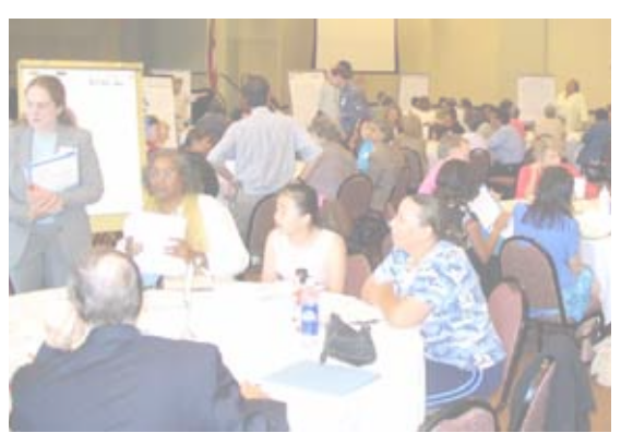
Photo from Citizen Voices on Pandemic Flu Choices: A Report of the Public Engagement Pilot Project on Pandemic Influenza (2005)