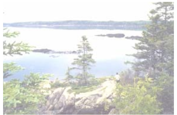
Horan Head, Cobscook Bay.

Then, a small collaborative group met during a six-month period and developed indicators to monitor those publicly identified values, as well as project ideas. Focus groups were formed again, so community members could ratify indicators and project ideas.