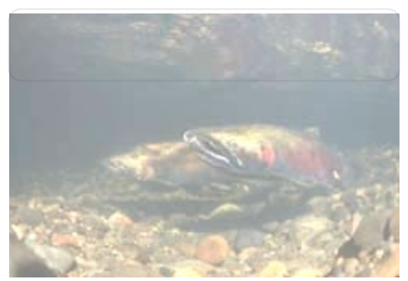
Coastal Coho Salmon

Commission. The Commission will likely adopt related rules in 2007.