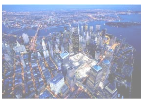
An aerial view of ground zero on Aug. 16, 2006

In fact, the deliberative group's plan included: a memorial; increased green space; residential and commercial developments for a "24-hour community"; accommodations for new transportation infrastructure; and reconnections to the street grid.<sup>64</sup>