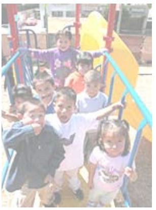
Compton Playground, Long Beach, California planner.kaboom.org/Projec t.asp?ProjectID=2452

The RAC meets monthly. It identifies and discusses problems in the housing project. Then, it presents those identified problems to the stakeholder group at its monthly Planning Group meetings, where decisions are made by consensus.