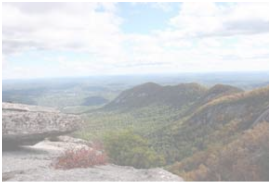
Eagle Rock, Hickory Nut Gorge, North Carolina

In 1999, an interagency task force on smart growth conducted a series of public meetings