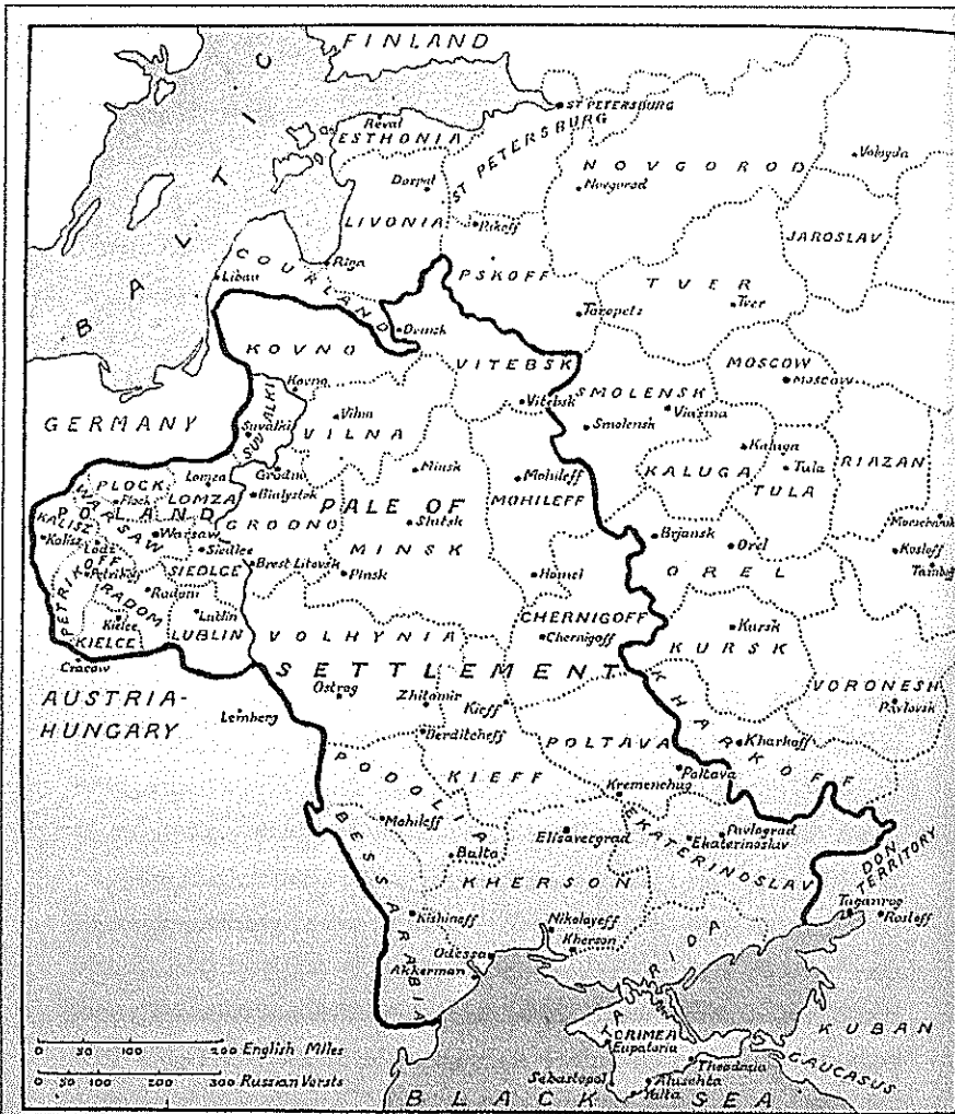
MAP OF THE JEWISH PALE OF SETTLEMENT AND RUSSIAN POLAND

Practically all the Jews in Russia—95 per cent. or even more—are confined to the fifteen governments of the Pale and the ten governments of Poland, which altogether constitute only one twenty-fourth part of the Russian Empire. The vast majority of them are still further restricted to the towns and townlets of the Pale, an area forming a two-thousandth fraction of Russian territory, although in point of actual numbers the ratio of the Jewish population of the Empire is to the Russian as one is to twenty-four.