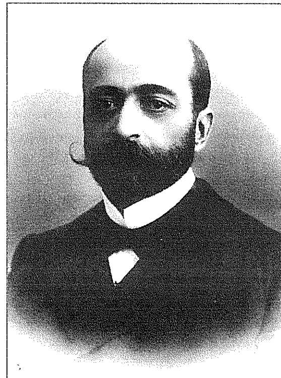
Krushevan in his twenties.