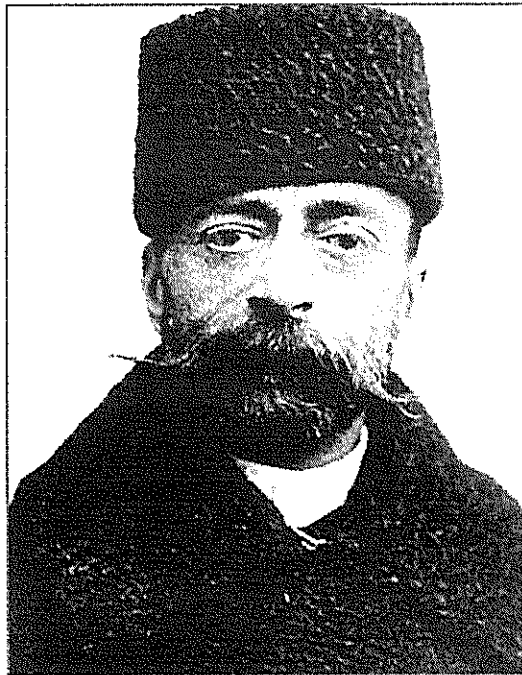
Krushevan in 1900.

Quite how he recovered, if at all, remains unclear. He would continue—even though he had sold Bessarabets when launching his new St. Petersburg daily—to serve as editor of the Kishinev paper. His new St. Petersburg publication was a four-page, large-size weekly available only by subscription because censors feared