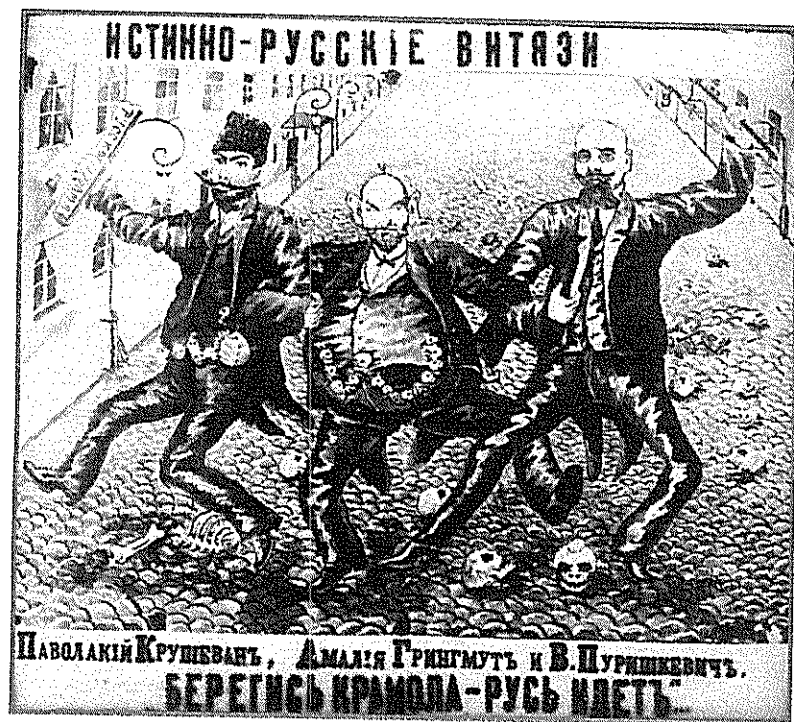
"True Russian Heroes." Postcard with satirical drawing of Krushevan (left) alongside extreme nationalists V. Gringmut and V. Purishkevich.