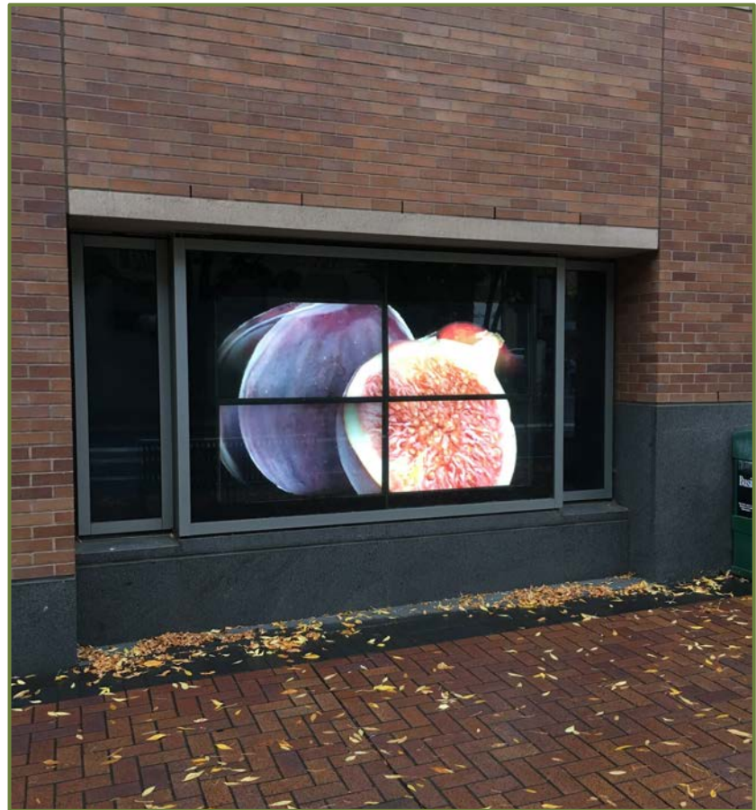
PSU FILM displays student work on SW 6th Avenue, in Lincoln Hall, on Vimeo , YouTube , and our Spring Showcase website.