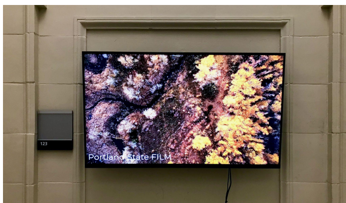
PSU FILM displays student work on SW 6th Avenue, in Lincoln Hall, on Vimeo , YouTube , and our Spring Showcase website.