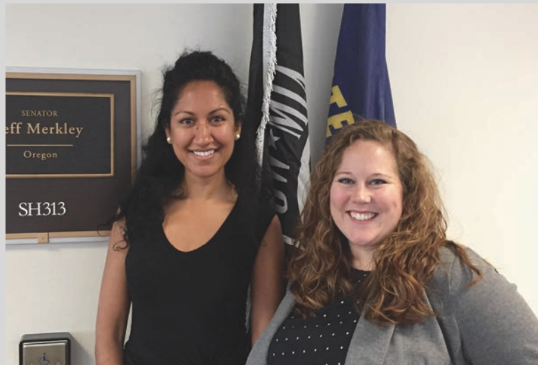
Table to help other counselors of color achieve their leadership goals by removing financial barriers.