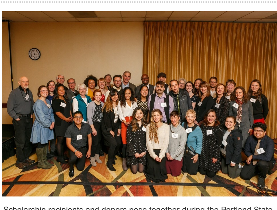
Scholarship recipients and donors pose together during the Portland State University College of Education Foundation Dean's Scholarship Celebration in November.