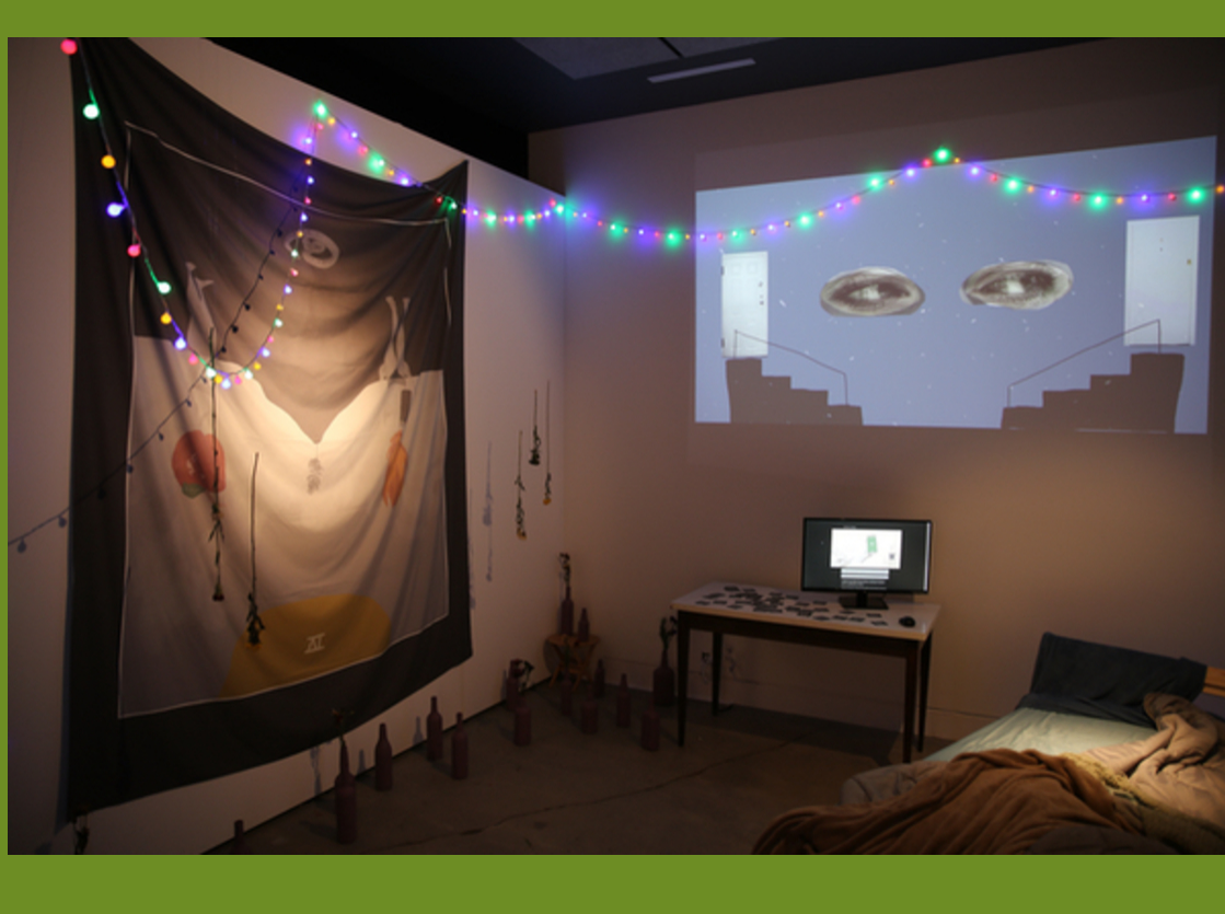
Exhibit celebrates Arlene Schnitzer Visual Arts Prize winners

Join leadership this Tuesday, March 9 from 3-4 p.m., for a presentation and question/answer session about the Academic Affairs budget and possible reductions over the next three years. (Connect via Zoom or live stream .) On Thursday, March 11 from 3-4:30 p.m., the provost-appointed Program Reduction Working Group and the Faculty Senate-appointed Ad Hoc Committee on Academic Program Reduction and Curricular Adjustments discusses proposed processes for possible program reductions. (Connect via Zoom or live stream .) Read more.