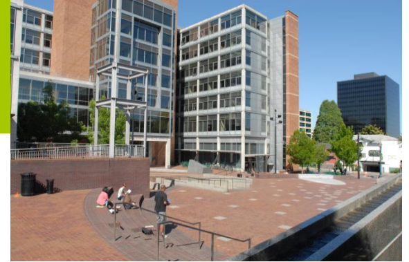
College of Urban & Public Affairs, Portland State University