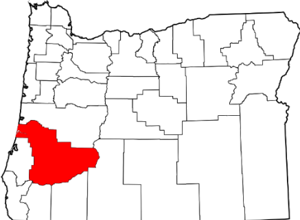
Figure 1. Douglas County

Since 2012, two grant-funded initiatives have been supporting work in NDC to strengthen early learning and K-12 systems coordination and alignment. The Yoncalla Early Works (YEW) initiative (funded by The Ford Family Foundation and Children's Institute) and the North Douglas P3 (NDP3) project (funded in 2014 by the Oregon Community Foundation), laid the foundation for the region's readiness to engage in a Community Health Needs Assessment (CHNA) planning process. The purpose of this process was to explore, understand, and integrate linkages between early learning and young child and family health; identify health-related resources currently available and accessible to NDC families; and prioritize health areas of interest to be explored during the CHNA. Ultimately, the planning process resulted in this plan to conduct the CHNA in North Douglas County, focusing on children ages birth-to-8 and their families.