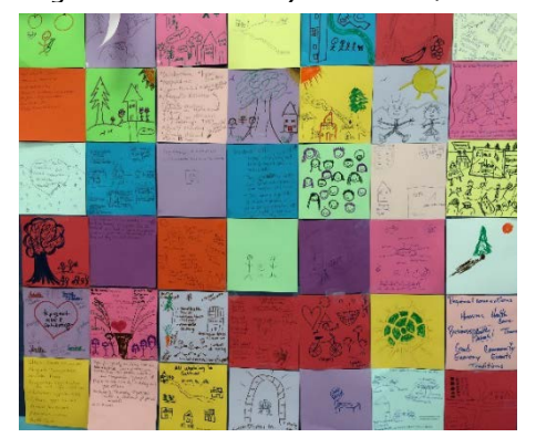
Figure 5. Community Health "Quilt"

At the start of the Kick-Off participants were invited to write or draw on a paper square in response to the question about what a healthy community looks like to them. Utilizing the local cultural and social value on quilt-making and story-telling, the paper squares were then pieced together to form a community health "quilt" to represent the elements of and vision for a healthy community. Also at the Kick-Off, participants were asked to reflect on why they care about the health of young children and families in North Douglas County. This served to set a foundation from which to build the planning process, drawing on community strengths and motivations.