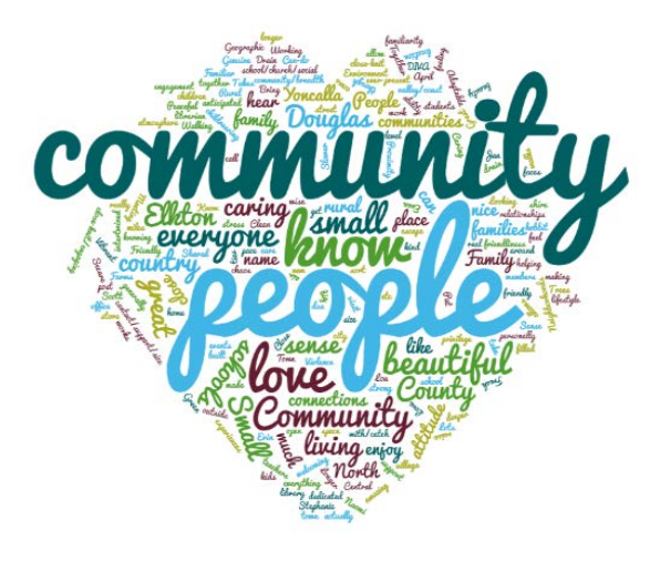
Figure 7. Community Café & Listening Session Word Cloud

"Healthy, happy children are the heart of our community." — Kick-Off Participant