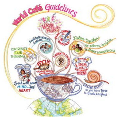
Figure 4. World Café Principles