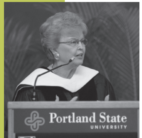
Gov. Barbara Roberts accepting the Urban Pioneer Award.

Governor Roberts addressed the graduates, challenging them to create just, compassionate, equitable and sustainable communities wherever they may go, and to think about how they want the story of their lives to be written. Her remarks inspired the graduates and audience, and made the ceremony a truly memorable occasion.