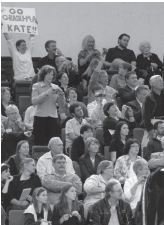
Proud family and friends cheering on the graduates.