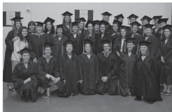
Students in the Master of Urban and Regional Planning program ready to march into the Hooding ceremony.