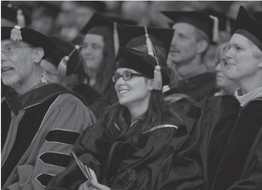
Students and faculty listening to Governor Barbara Roberts' speech.