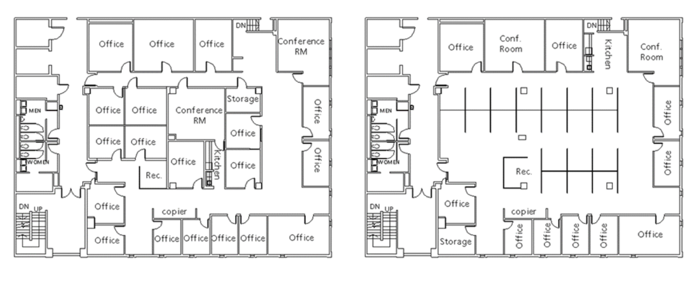
Figure 2: Common office typologies